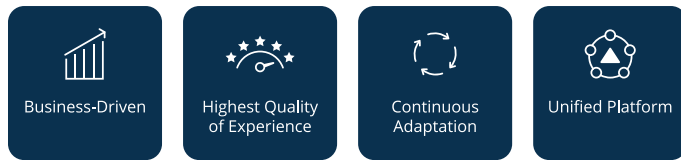
Figure 1: Forward-thinking executives choose the Aruba EdgeConnect SD-WAN platform

With more than 2,000 production deployments, customers have identified four unique areas of business value as the reasons they've chosen the Aruba EdgeConnect unified SD-WAN platform. The platform enables customers to build a unified WAN edge that is business-driven, delivers the highest quality of experience, continuously adapts to changing business needs and network conditions. It is designed to enable enterprises to fully realize the transformational promise of the cloud.