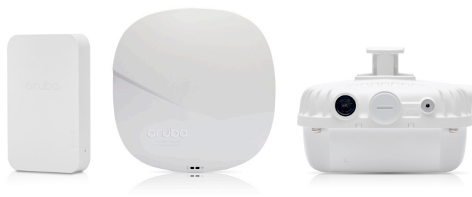
Aruba Access Points 203H, 325 and 360